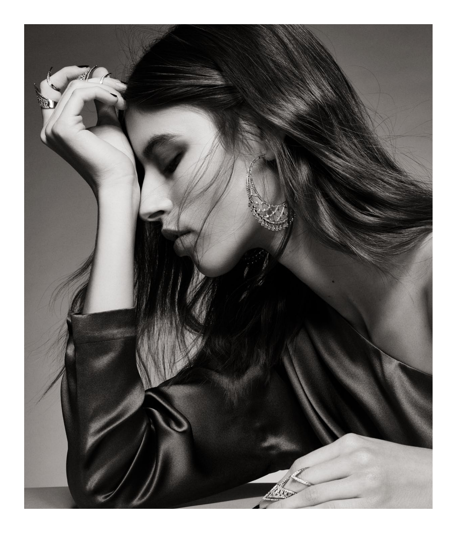
Ring: White gold and 0.84ct of diamonds | Earrings: Rose gold and 8.09ct of diamonds Ring: Rose gold and 1.17ct of brown diamonds