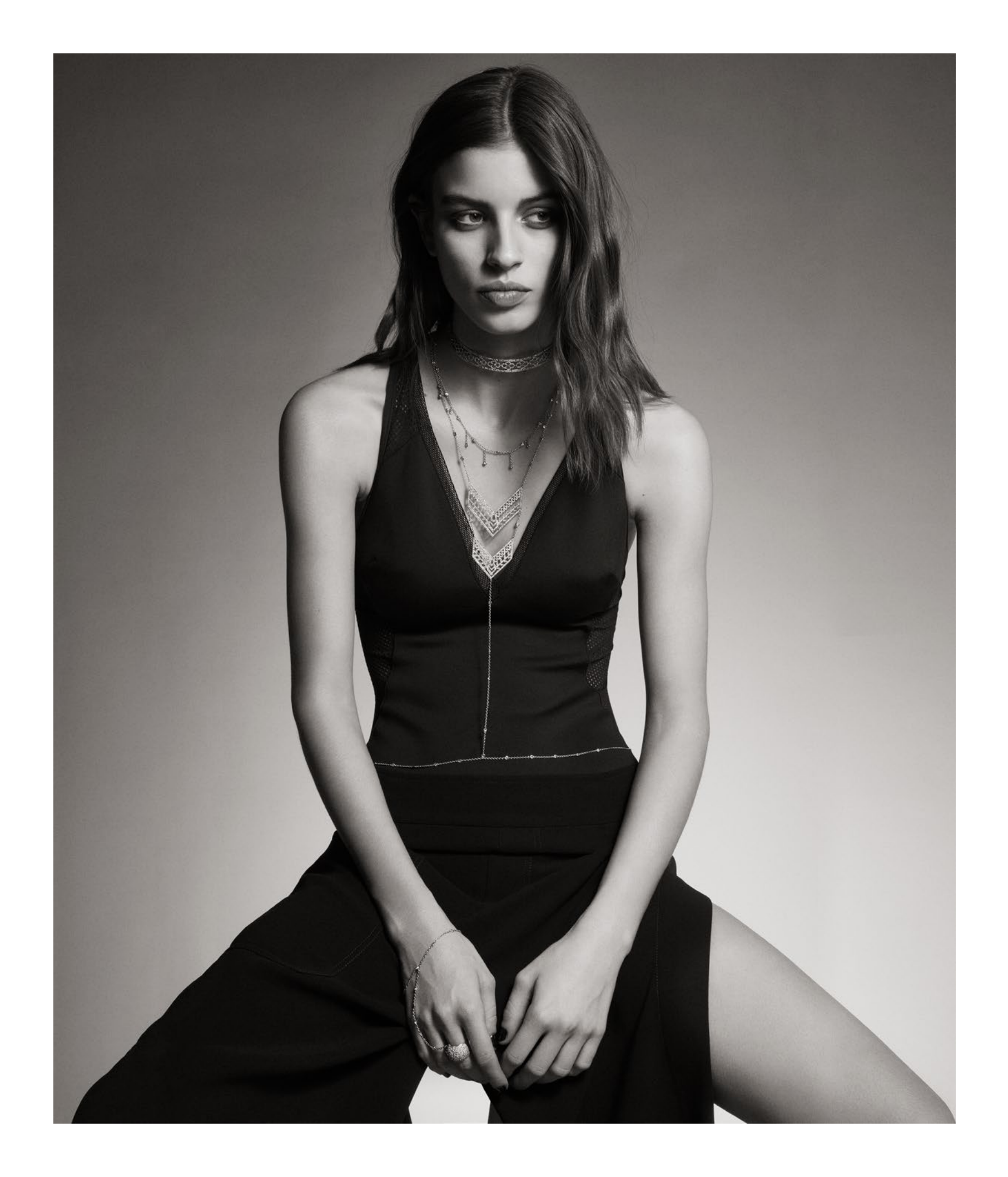
Choker: Rose gold, 3.90ct of diamonds and 0.20ct of rubies | Necklace: Rose gold, 1.0ct of diamonds and 0.86ct of emeralds Necklace: Rose gold and 5.82ct of diamonds